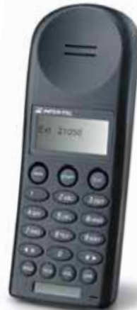
Model 8524 & 8525

Inter-Tel Model 8524 is a 900 MHz cost-effective digital wireless endpoint that facilitates the mobility of on-the-go professionals. Users can check voice mail and access system features such as initiate, conference, transfer, mute and forward calls. These models also offer a two-line alphanumeric display with icons, function keys, status indicators and speed-dial options. Inter-Tel Model 8525 additionally features a vibrate mode.